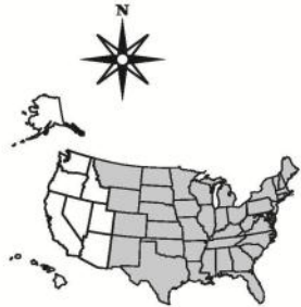
PACIFIC REGION OF AA