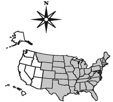
PACIFIC REGION OF AA